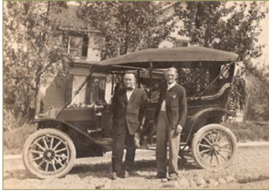
could drive either horse or auto, on the left. The car is noted as a Krit, and the photo pre World War One.